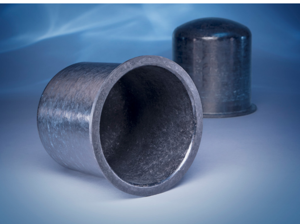
Xycomp® DLF™ composite containment shell