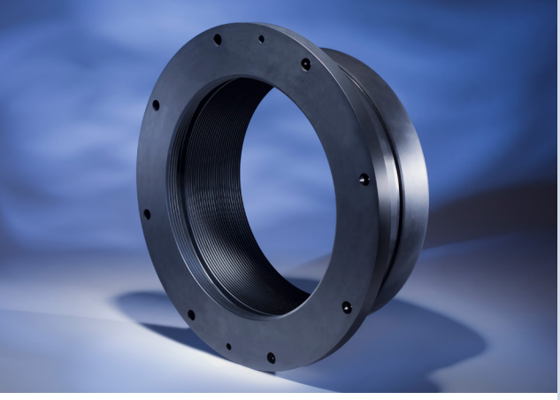
Labyrinth seal – made from Arlon<sup>®</sup> 4020, approximately 25 in. (63.5 cm) in diameter